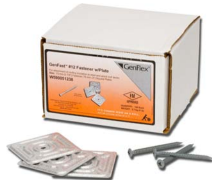
2-7/8" #12 GenFast™ Screws & 3" Insulation Plates, 100 / box

But wait, there's more! We didn't just stop at developing the SmartSize™ products and expect for you to have to seek them out. We've developed a great way to display SmartSize™ products right in the showroom so you can just Grab-Em-And-Go! Introducing the GenRack Showroom Display System. GenRack has been carefully designed to display not only the SmartSize™ Accessories, but also many of our standard membranes.