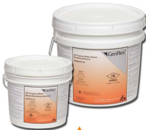
All Purpose Water Based Bonding Adhesive in 1 & 3.5 gal. pails

You've already begun seeing our new, eye-popping labels; now you get to see the rest of what we've been working on for the past few months to bring them even close to you. Here is a small sampling of what's now available to you. The entire line of SmartSize™ products accompanies this Bulletin. And, of course, you may always find this information on www.GenFlex.com .