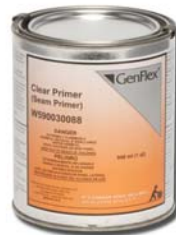
Clear Primer in 1 qt. cans