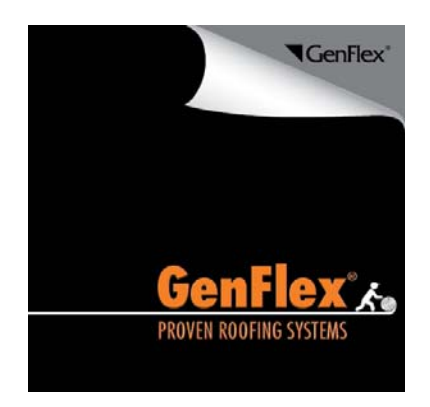
Single Ply Solutions for Over a Quarter Century™